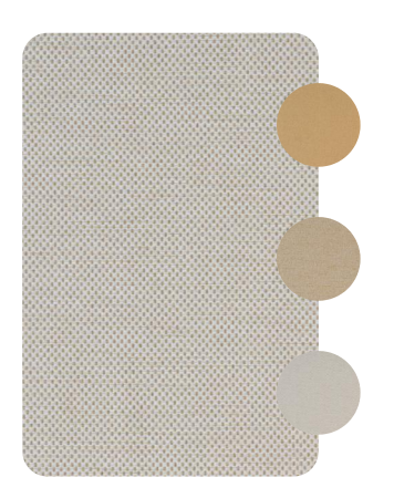
TE TOSCANA 1